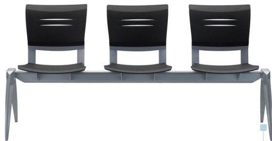
Painted epoxy polyester base